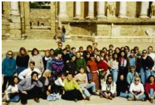
1992-93 WIP Students in Merida

Con: The excursions contribute to student bonding, although it is fair to state that, for a few students, they can also lead to occasional misbehavior or demonstrate a lack of cultural curiosity, which is not unusual in large group activities.